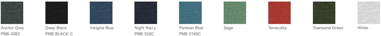
Anchor Grey PMS 426C

Please note: PMS code information is shown only when an exact match is available.